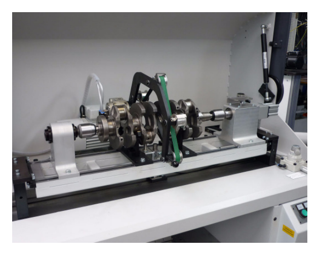
Measuring frame with belt drive