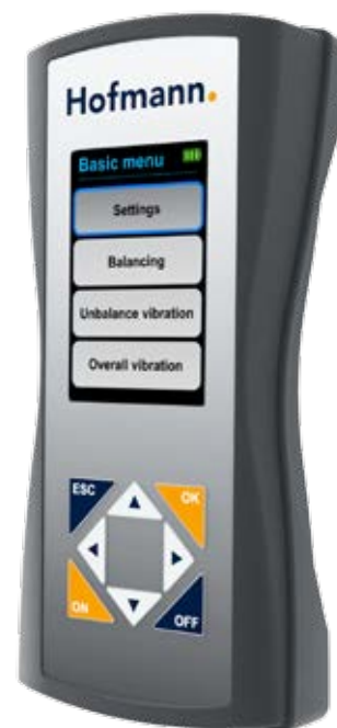
EasyBalancer EB 3500