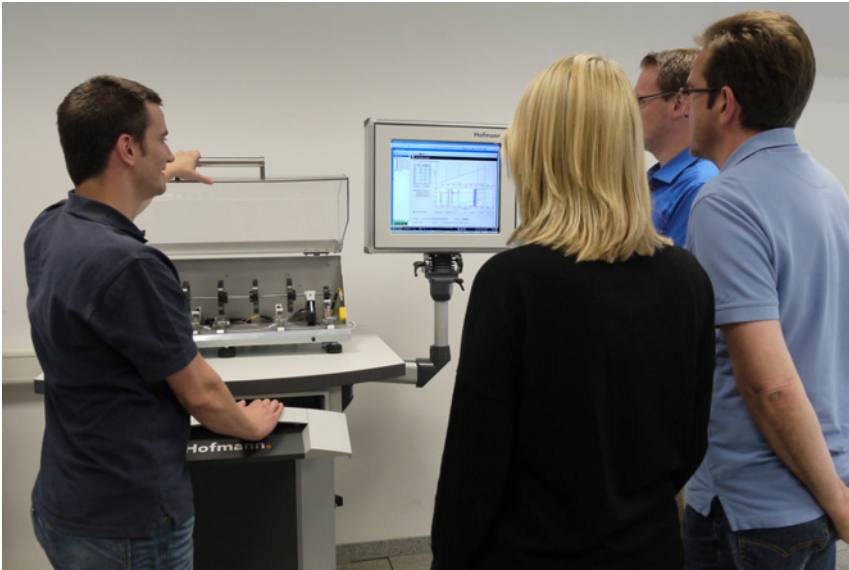
Testing of balancing methods with flexible model rotor.